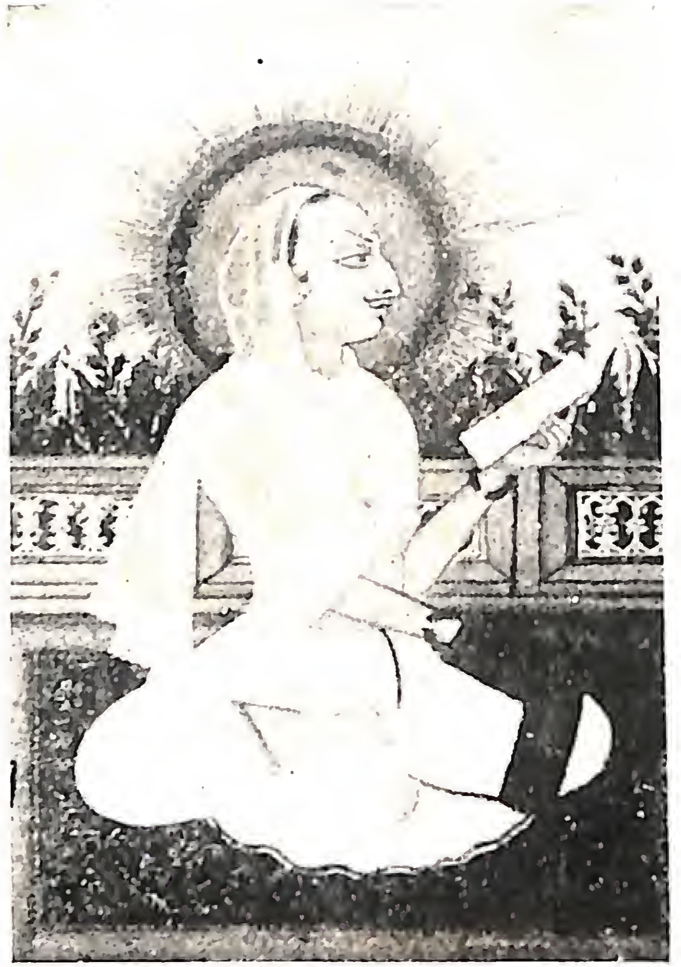
Goswami Shri Giradharaji See page 346